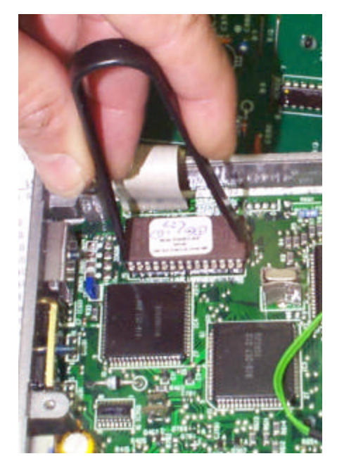
REMOVE THE CHIP USING A RE-MOVAL TOOL. TRY RADIO SHACK IF YOU DON'T HAVE ONE.