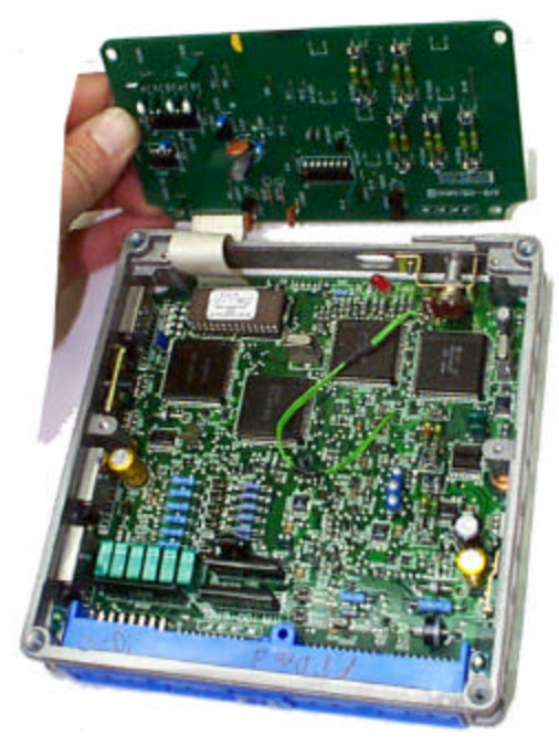
LOCATE THE REMOVABLE CHIP IN THE ECU.